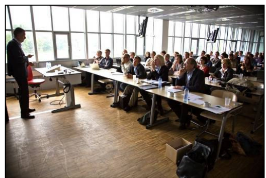
RAMIRI Workshop Amsterdam, June 2011

The Learning Programme addresses 6 broad management topics: Making the Case; Financing; Legal and Governance issues; Project Management ('life-cycle' of a RI); Human Resources and Strategic planning for an established RI.