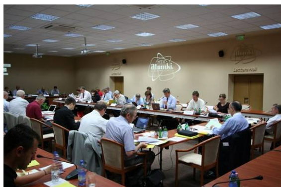
ESFRI Meeting at ATOMKI Debrecen, June 2011