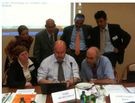
ESFRI Executive Board deliberating Debrecen, June 2011

During the 38th ESFRI meeting which took place in Brussels on 23 September, an in-depth discussion took place on the challenges ahead for the Forum and the European Research Infrastructure landscape.